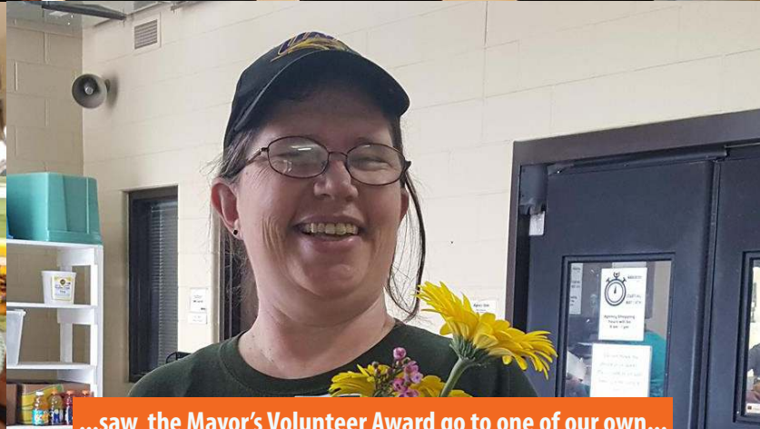
...saw the Mayor's Volunteer Award go to one of our own...