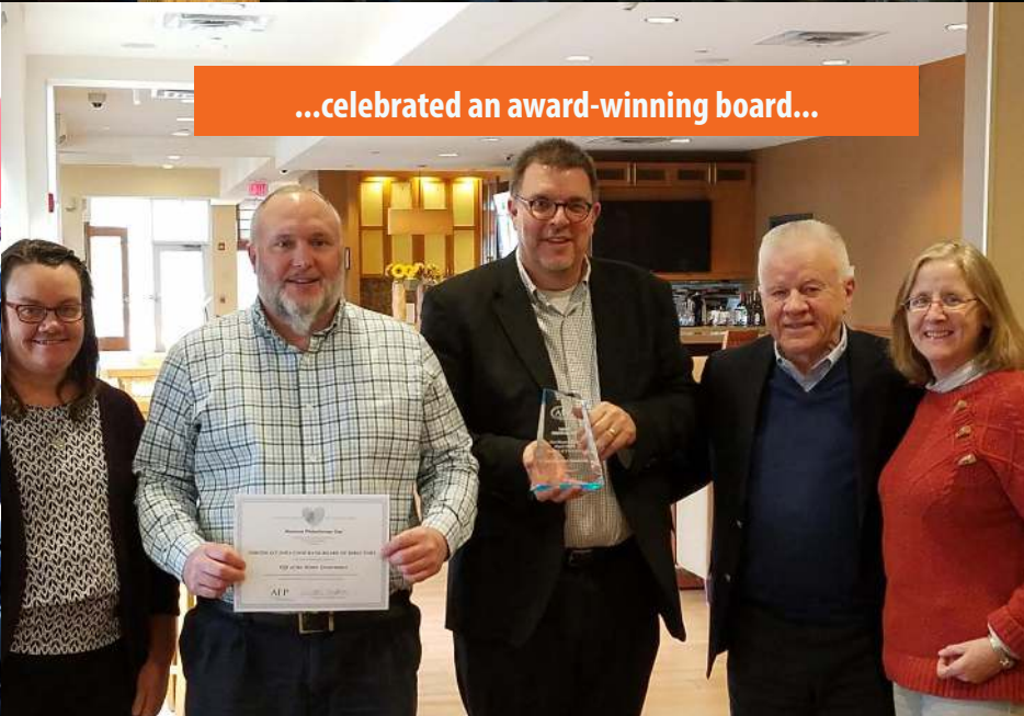
...celebrated an award-winning board...