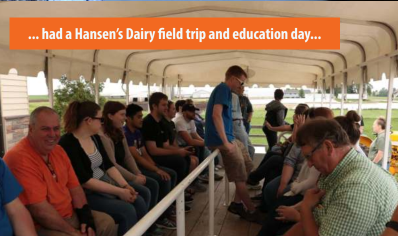
... had a Hansen's Dairy field trip and education day...