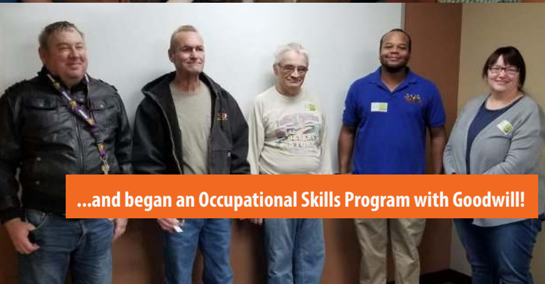
...and began an Occupational Skills Program with Goodwill!