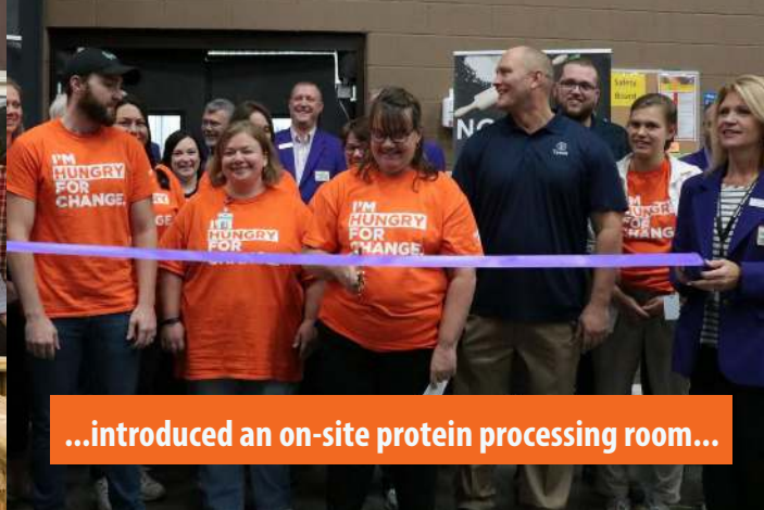
...introduced an on-site protein processing room...