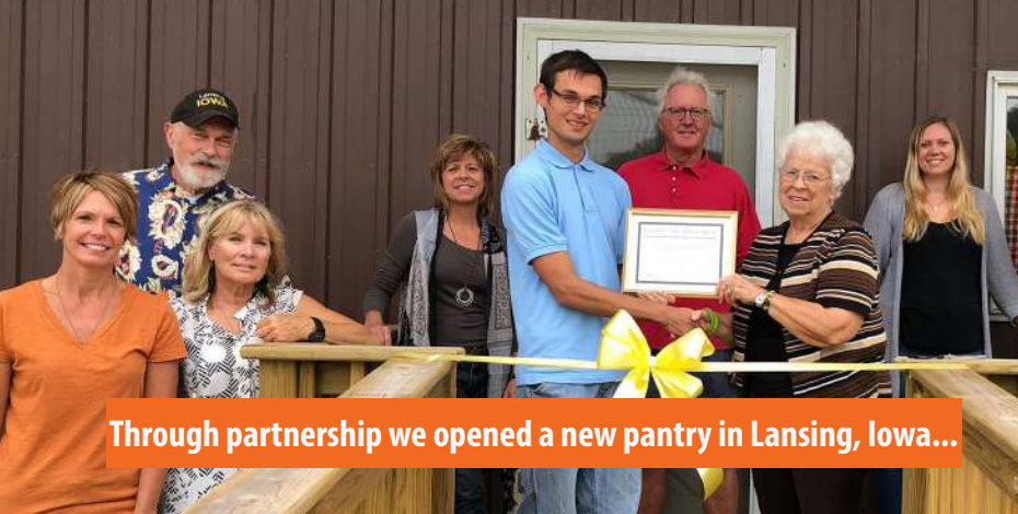
Through partnership we opened a new pantry in Lansing, Iowa...