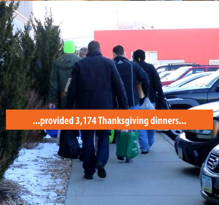
...provided 3,174 Thanksgiving dinners...